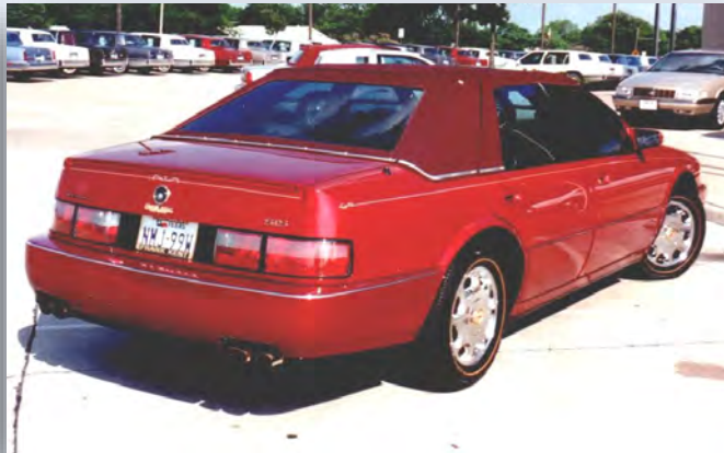
Restyled haul hiney “STS” 0-60-6.8 seconds