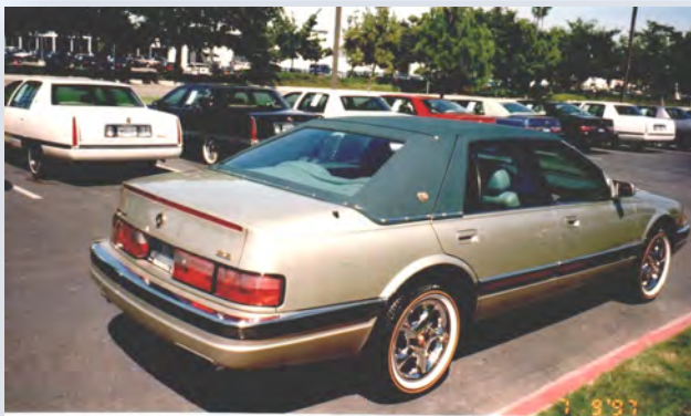
Aesthetically, distinctive, alluring “SLS”