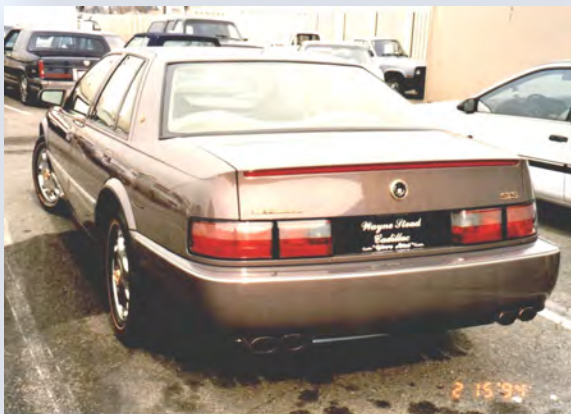
Mocha color “STS” 32 valve 300 HP