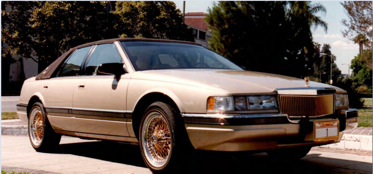
Revered restyled fashion centers featured Seville “SLS”. Motor Trend’s #1