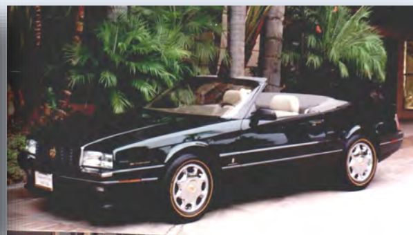
1993 Allante` - now a sound affordable investment. 5,000 miler oil changes