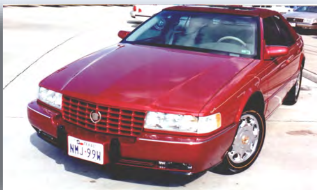
Seville “STS” 300 HP Northstar race car