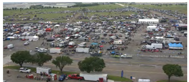
Pate Looking Center