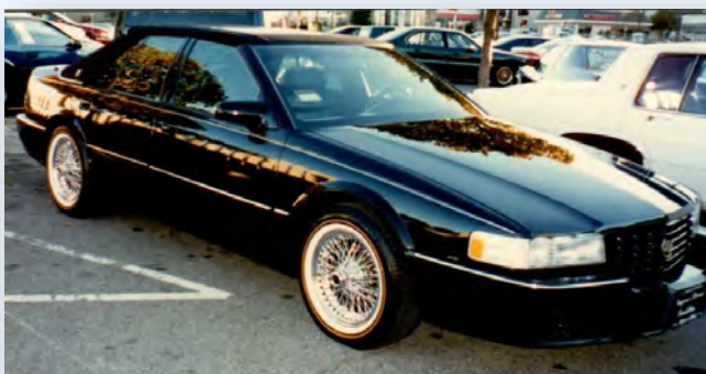
"STS" real wire wheels, 125 mph., Vogue Tyres, caution avoid curbs