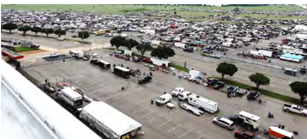
Pate Looking South