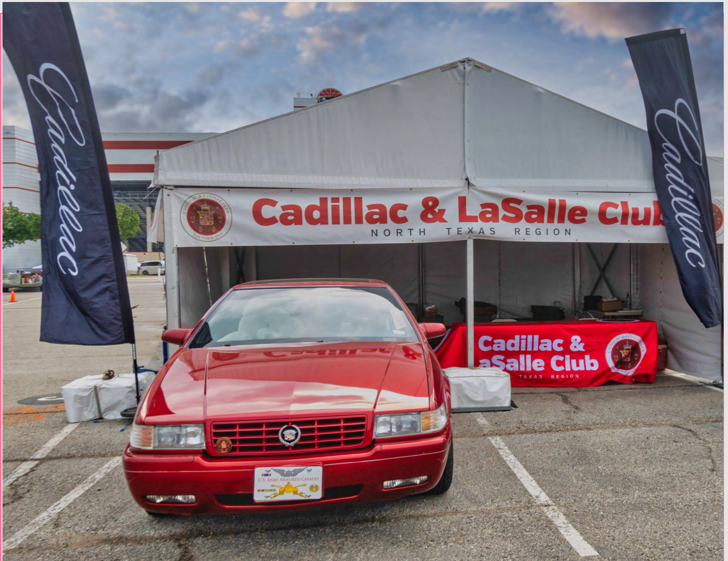
2001 Cadillac Eldorado on display at NTXCLC Hospitality tent during 2024 Pate Swap Meet