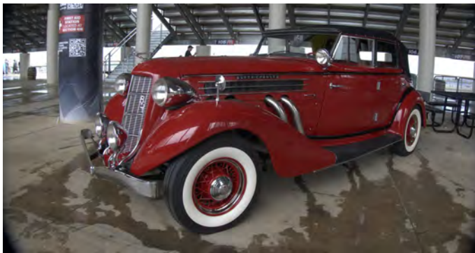
Duesenberg Model J